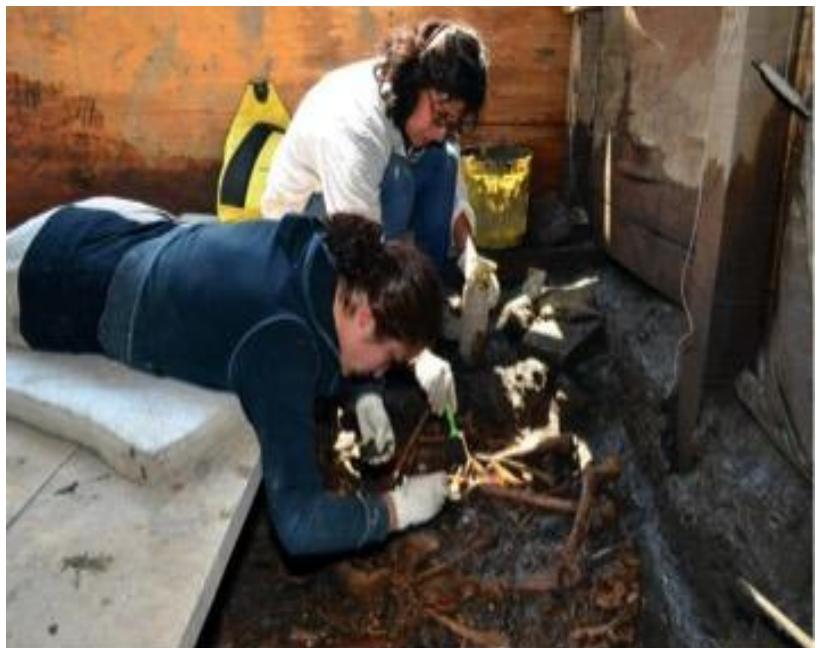
Archaeologists removed human bones found recently at the Templo Mayor site

In this case, we used the QFT to stage the Aztec inquiry’s compelling question. The QFT is a strategy that allows teachers to scaffold questioning outcomes by creating a curricular space for students to be curious at the onset of an inquiry. The process begins when teachers provide students with a provocative “Question Focus” or stimulus—a juicy quote, a stunning image, a sardonic political cartoon—and a little bit of structure—don’t censor yourself, ask a lot of questions, and be curious. And then, we observe. For the Aztec inquiry, we provided students with a Question Focus using the following quote and images from the article “Mexico City’s Aztec Past Reaches Out to Present” ( New York Times , September 2, 2012).